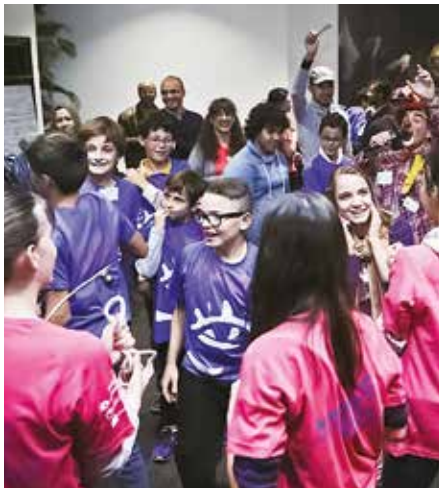
France: An information day for children with MS and their families.

Although MS will sometimes make certain sports or activities more difficult, children with MS should not feel they need to stop being active and rest all the time.